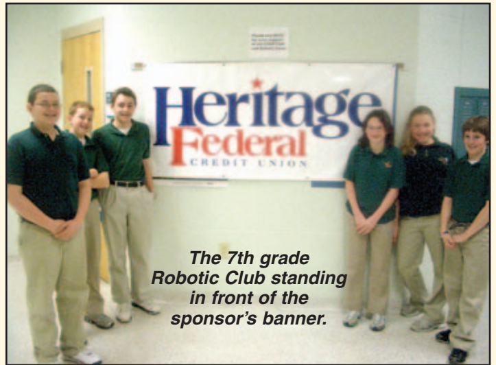
The 7th grade Robotic Club standing in front of the sponsor's banner.

Everyone in the parish is invited to come shop.