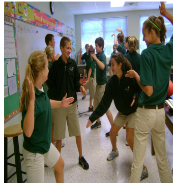
Good Shepherd Students Engaged in a Classroom Energizer.

Every time we move in an organized manner, full brain activation and integration occurs, and the door to learning opens.